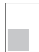
1/3 square 4.75 x 4.75