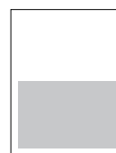
1/2 horizontal 7.375 x 4.833