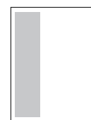
1/3 vertical 2.2361 x 9.625