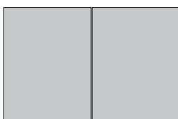
Spread (bleed) 16.75 x 10.75 (plus bleed 17 x 11)

Delivery by e-mail preferred. (Mac-formatted CD-R accepted.) Only one ad per file. Native application files not accepted.